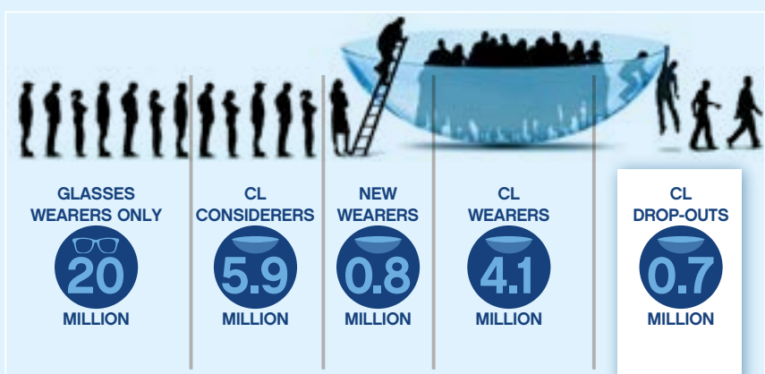
Figure 1. The UK contact lens market in 2016 1

This article will review what we now know about dropout at these key moments, how we can identify those at risk and how we can tailor our management strategies to support retention at each stage.