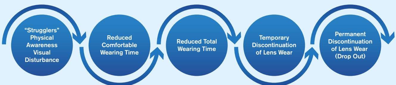
Figure 5. Progression of contact lens discomfort, adapted from TFOS 19