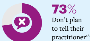
Figure 4. Experience among the 2/3 of patients reporting comfort issues with widely prescribed monthly lenses (n=237 17 and 758 18 )