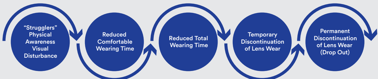
Figure 5. Progression of contact lens discomfort, adapted from TFOS 19

Many contact lens types are associated with reduced user comfort from mid-afternoon onwards. 20 Although declining comfort over the course of the day is also influenced by changes to the ocular environment, 21 there may be little the wearer can do to alleviate ambient conditions or avoid challenging visual tasks such as prolonged digital screen use. Clearly it is important to