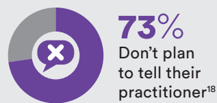
Figure 4. Experience among the 2/3 of patients reporting comfort issues with widely prescribed monthly lenses (n=237 17 and 758 18 )

Questioning about compensating behaviours, and asking whether lenses are as comfortable at the end of the replacement cycle as on day 1, can help elicit much more from those patients who may seem 'fine' but clearly are not.