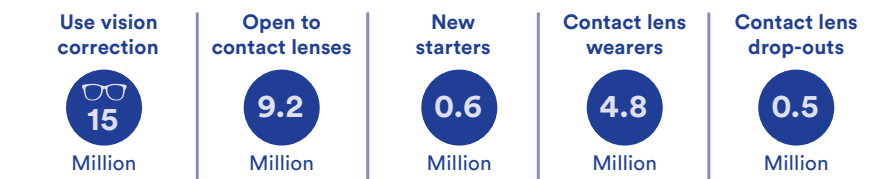
Figure 1. The UK contact lens market in 2022 1